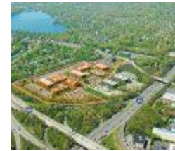
Lanidex Plaza Trades Hands in